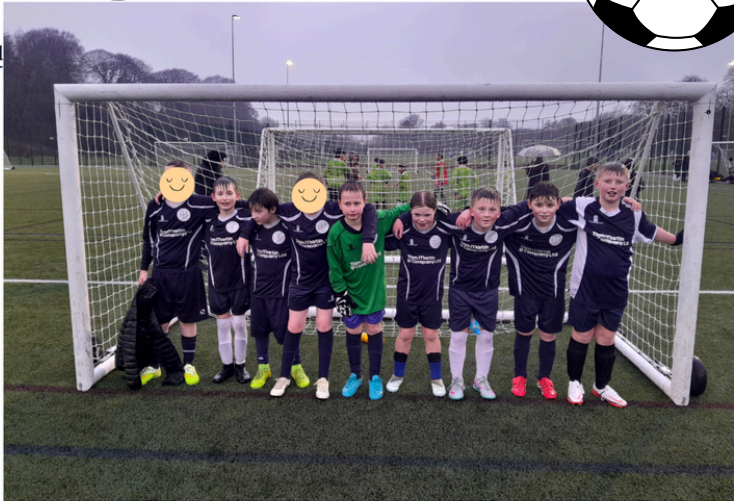
Year 5 & 6 League Champions